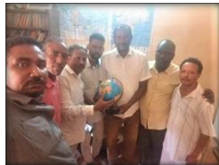
Above: Several members of the newly established Missions Board focused on reaching Ethiopian and Eritrean refugees.

In cooperation with Ethiopian and Eritrean churches in Sudan, NLICM has established a new missions board that will be responsible for training and preparing missionaries to reach refugees in Um Rakuba, Tendba, Hamedayt, and Shegerab (the Eritrean refugee camp in North Sudan).