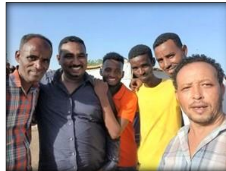
Below: Missionaries in Um Rakuba refugee camp.